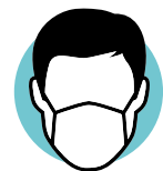
High quality masking